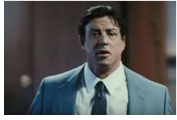
"...Cause if you're willing to go through all the battling you got to go through to get where you want to get, who's got the right to stop you?

"Every time I hit, I need to make a dent"