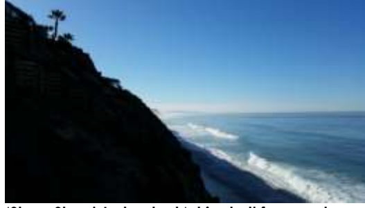
'Stone Steps' Just a short 'chip shot' from my house

Within 10 days, I moved into a house in Leucadia Ca, surrounded by $2 - $5M homes for $1650 per month, with this view!!