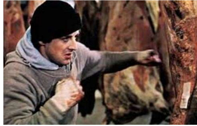
Rocky pounding meat and breaking ribs – an unconventional method

..now, if you know what you're worth, then go out and get what you're worth. But you gotta be willing to take the hits, and not pointing fingers saying you ain't where you wanna be because of him, or her, or anybody. Cowards do that and that ain't you. You're better than that!"