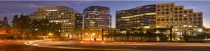
Fix My Report & Maverick Venture Group LLC

“Done for You” Credit Solutions Designed For Successful People With Busy Lives 858 270 0251